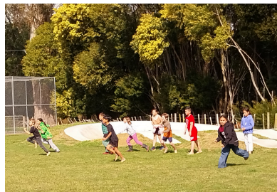
Congratulations to Te Ngahere for receiving the attendance award last week