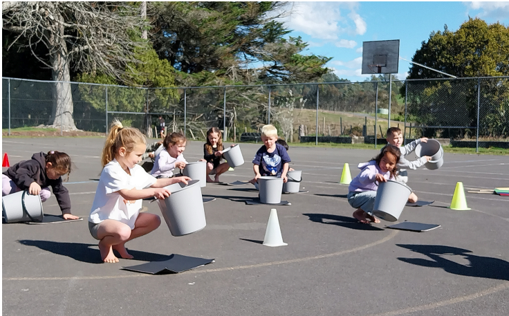
Production Practice is in full swing