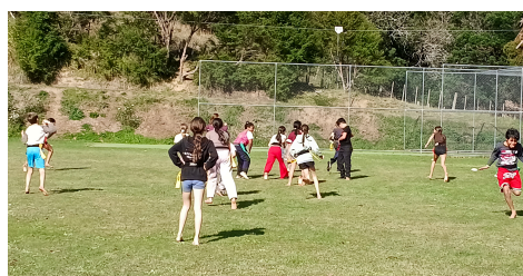
Rippa rugby practice

Donations of fresh fruit are always appreciated and help provide healthy snacks for our students. If you are able to share some of your surplus, we would love to take it off your hands.