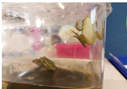
Te Uenuku's class frogs

*Sausage Sizzle Fridays $2.50 each (Cash only)