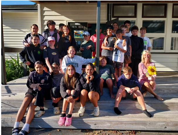
Week 1 Attendance award goes to Te Ngaru