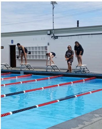
Country Swimming Sports