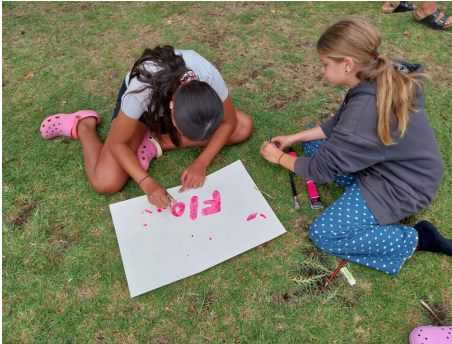
Gala signs are being created