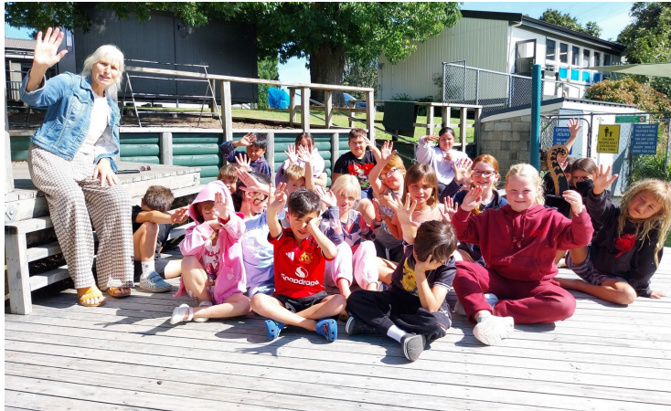
Congratulations to our Players of the Day

This week's attendance award goes to Te Maunga - Well done!