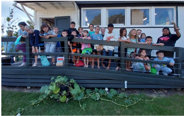
Attendance award goes to Te Maunga