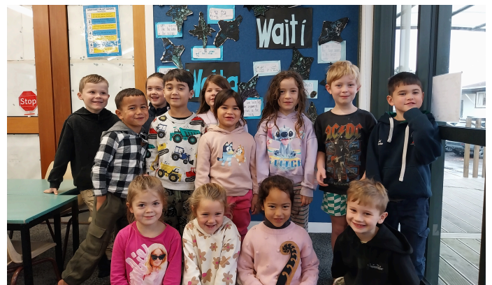
Thank you to our carpet layers - we love our new carpet