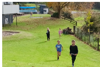
Congratulations to our Players of the Day for Hockey and Netball