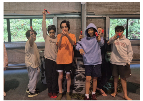
Room 3 Camp at Tui Ridge