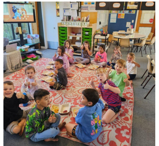
Room 2 Te Uenuku celebrating their Term 1 attendance reward!