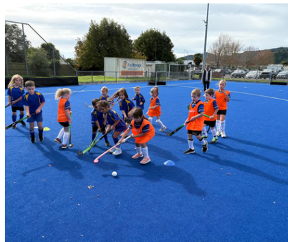
Our Y1 and 2s playing their first game of hockey.