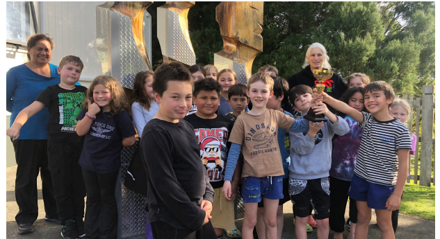
Te Awa has been studying different countries attending the Olympics

Last week the Attendance Trophy went to Te Maunga