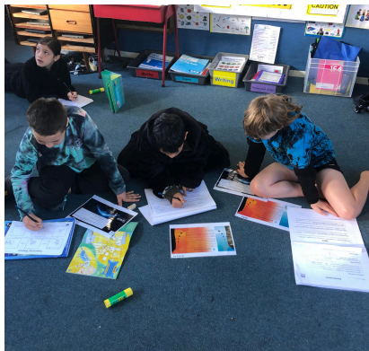
Te Maunga students are working hard on their literacy skills.