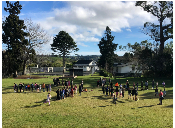
Everyone joined in a wheel relay - a fun way to get to know their team mates for Marae visit.