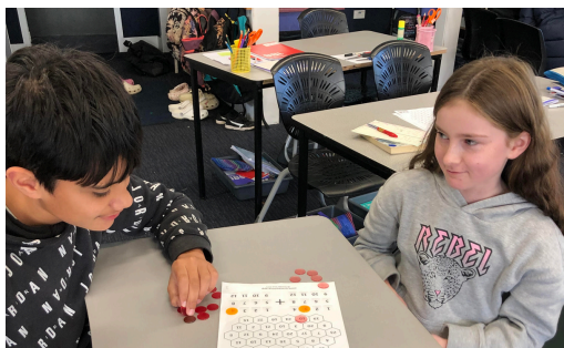
Te Ngaru students are battling each other in a strategic math game, called Number five